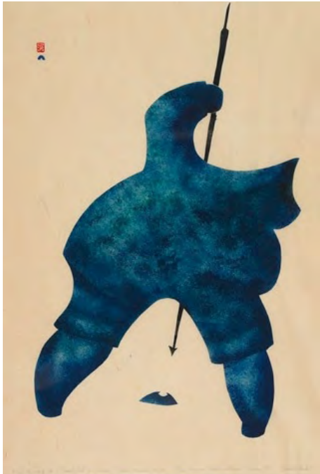
Inuit stencil - Man Hunting at a Seal Hole (Niviaksiak)